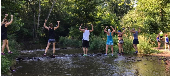
Runners navigate across a cable bridge at the Chobot Challenge