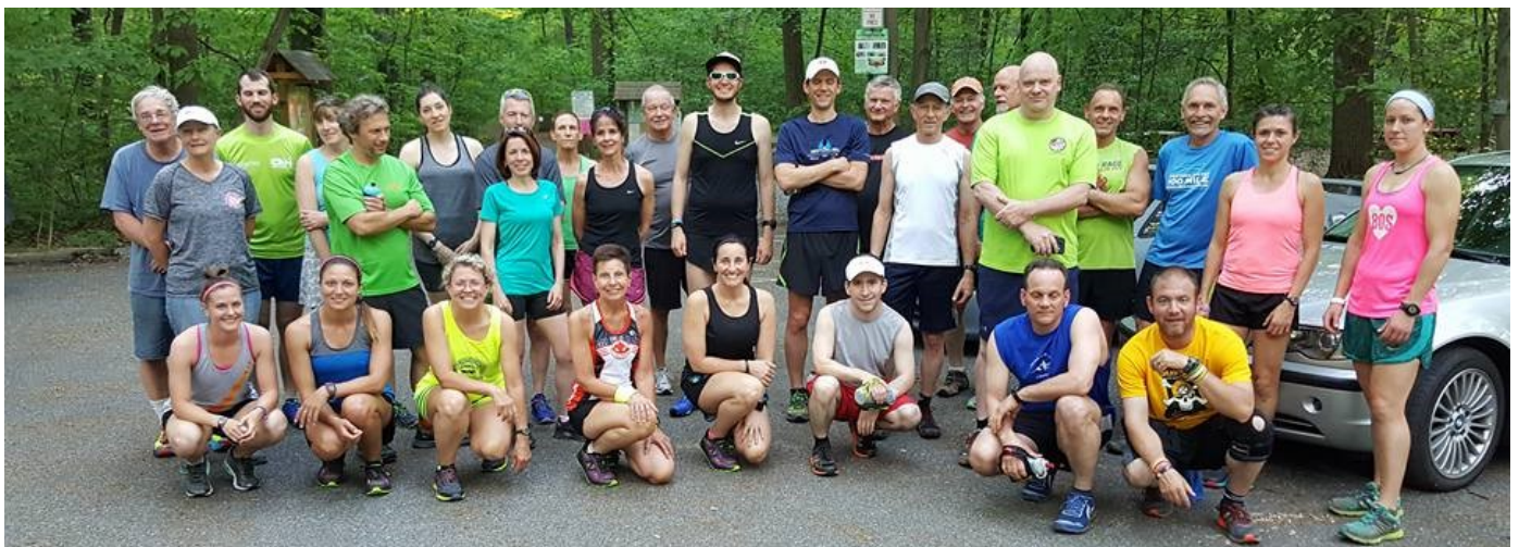
Wednesday night group run on May 17 at Monocacy Hill Recreation Area