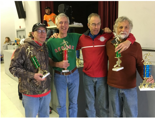
Photos from Shiver Awards Ceremony